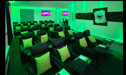
LIVE Beaming Clinic